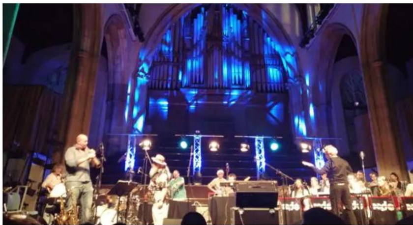
Hermeto Pascoal, band and NYJO in Norwich.