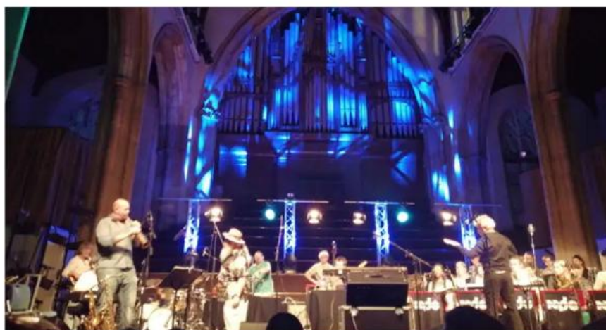
Hermeto Pascoal, band and NYJO in Norwich.