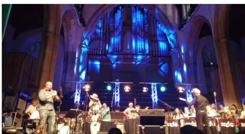
Hermeto Pascoal, band and NYJO in Norwich.